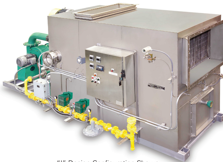
"L" Design Configuration Shown

The ER Indirect Air Heater is a completely packaged system that includes the heat exchanger, recirculation fan, combustion chamber, burner,